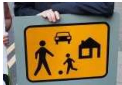
E, 17 a

Figures: The sign on the left is the international sign for residential area with maximum speeds of 20kmh and legal priority to pedestrians (Vienna Convention on Road Signs and Signals). The sign on the right is the one announced by the Irish Minister for Transport on 19 March 2015.