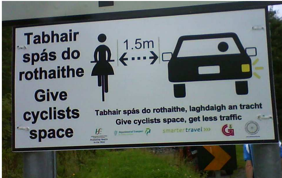
Bike Week 2009: one of the Galway Cycling Campaign's passing distance signs