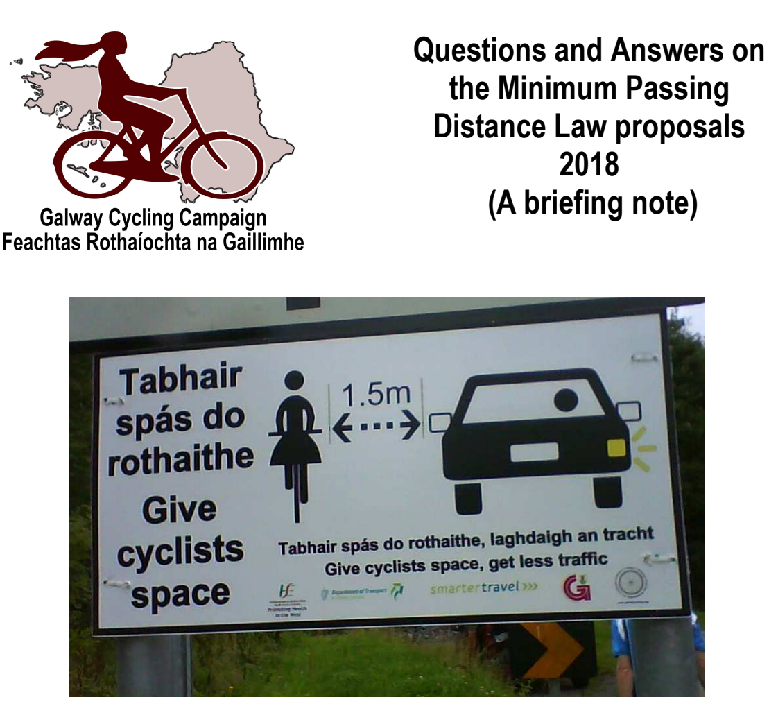
Bike week 2009: one of the Galway Cycling Campaign passing distance signs