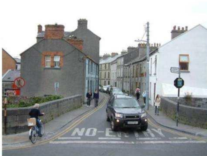
Nuns island, home of the "Bish" secondary school. Historically the Bish had one of the highest rates of cycling in the city (24%) Do you think its right to make it illegal to cycle to school?

The pictures below show situations where Galway city and county councils have effectively made it illegal for children to cycle to school by the most direct route. Examples in Galway city include the “Bish” Secondary School in Nuns Island and Scoil Náisiúnta Iognáid in Raleigh Row. In the county town of Tuam there are three schools near the centre on the Dublin Road, yet the county council has made a strategic section of this road one-way – apparently to provide disk parking. Two primary schools (the Mercy and Presentation Convent) and one post-primary school (St Bridget’s) are affected. The net effect is to make it illegal for children from the south side of town to cycle to school. It also makes it illegal for children from the north side to cycle home by the most direct route. In Loughrea there are two primary and two post-primary schools in the Moore St/Cross St area. But the county council has made Moore St one-way, again effectively banning some children from cycling to school by the most convenient route.