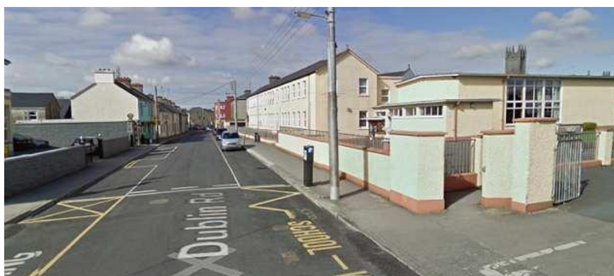
Tuam: Google Street View showing Dublin Rd at the Mercy Convent school. The road is one-way, making it illegal for schoolchildren to cycle in both directions. The disk parking arrangements with painted parking lanes and ticket machines can be seen.