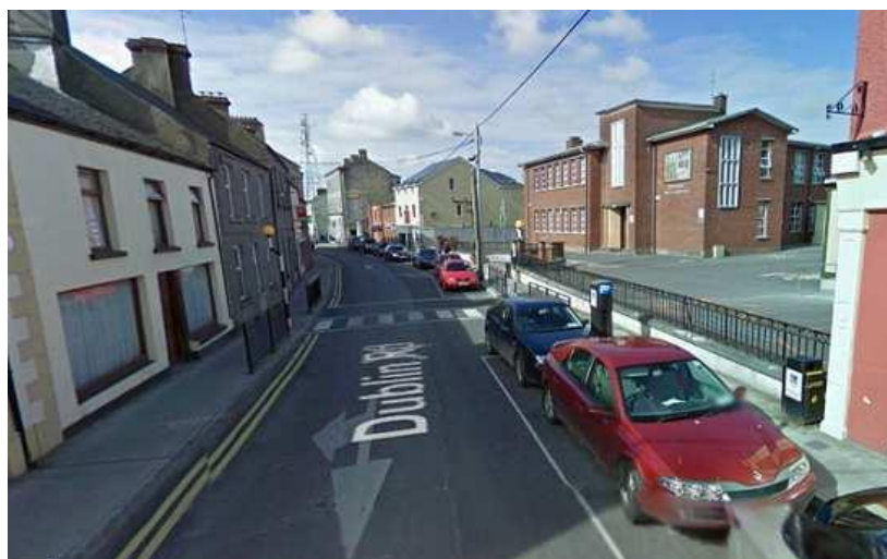
Tuam: Google Street View showing Dublin Rd at the Presentation Convent school. The road is one-way, making it illegal for schoolchildren to cycle in both directions. The disk parking arrangements with painted parking lanes and ticket machines can be seen.